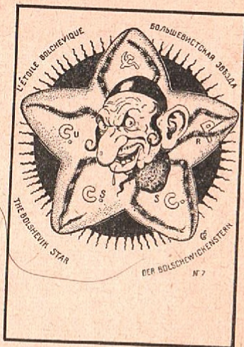
The pictures on this page are reprints of cartoons which are now being circulated by Russians living in exile in Europe who have become bitter enemies of the Jews because of Bolshevism.